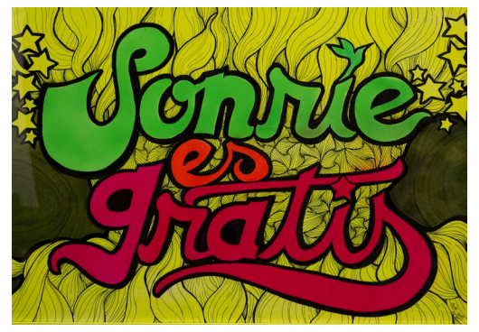
Moisés Sants, Sonríe es Gratis, (Smile it's Free), Pen & acrylic on paper, 2019. Revolución Chicha.

Many details go into each exhibition to present the artist's vision and voice. Along with the visual elements: selecting the art, deciding on arrangement in the gallery space, and lighting, the written elements, the labels and text panels, are there to provide insight into the artist's materials, thought process, background and influences. Once the show opens, the creative cycle of an exhibition doesn't end. It begins a new phase in dialogue with the community.