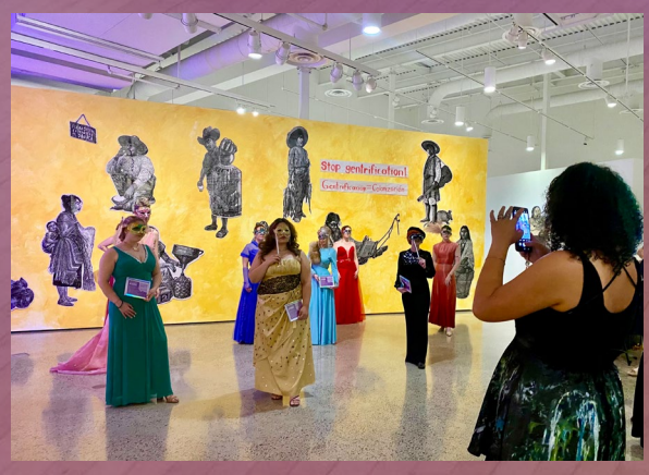
Masquerade Models with hair and makeup by HeadCases Salon; clothing by Dollhouse at Pointe Foure