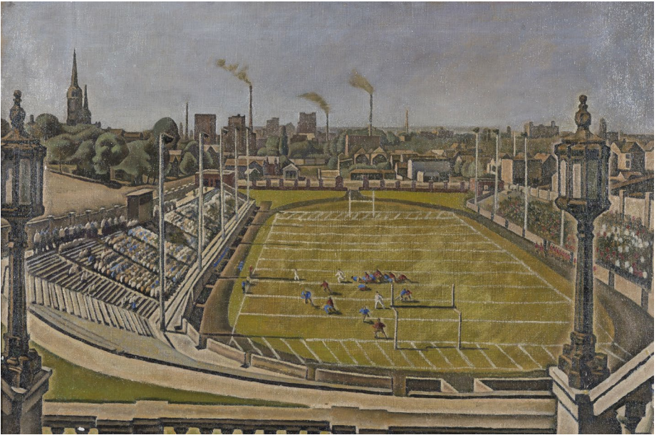
Joseph Plavcan, Academy Stadium, oil on canvas. EAM Permanent Collection.