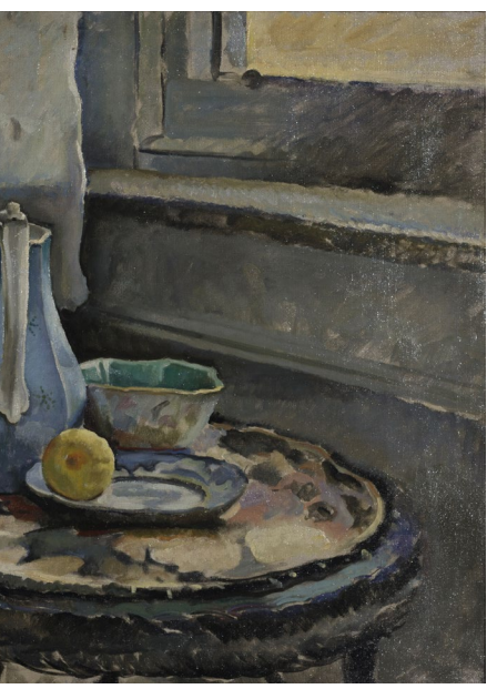
Joseph Plavcan, The Blue Pitcher , oil on canvas, 1930. EAM Permanent Collection.