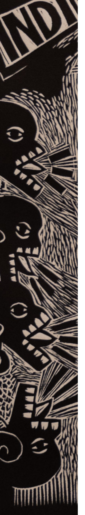
Background image: El Pinche Grabador, Recordatorio Nacional (National Reminder), Las Calles de Oaxaca. 2014. Linocut on paper.