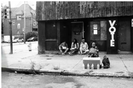
Hustle & Rise, Digital Photograph, Jaime Bird