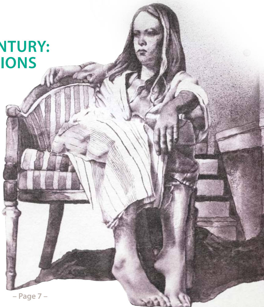
Untitled, Barbara Rowe , two-color lithograph, 1977. EAM permanent collection.