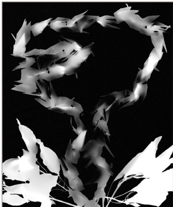
elin o'Hara slavick, Fukushima Persimmon Tree Heavy with Contaminated Fruit II , 2019 Solarized silver gelatin print