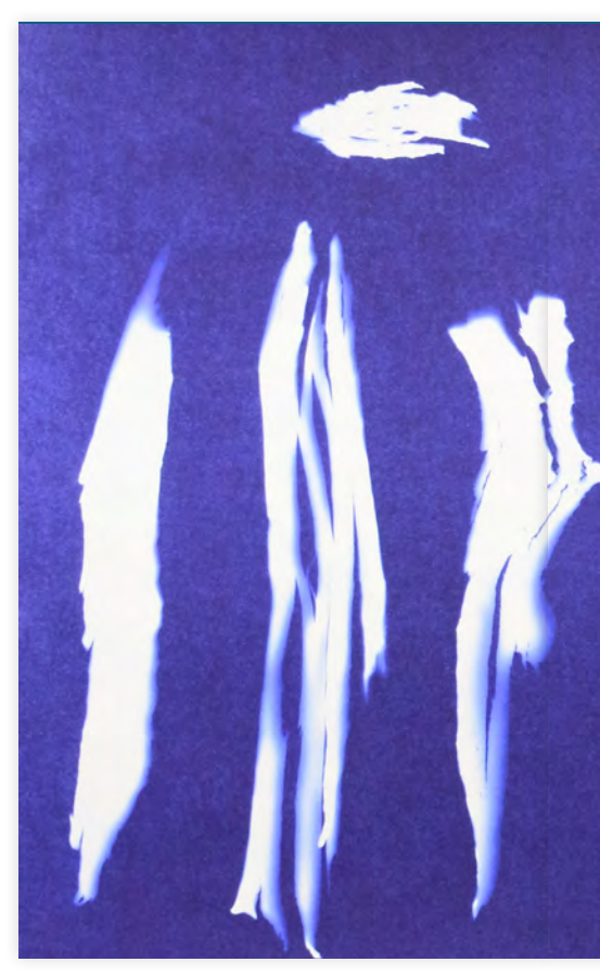
elin o'Hara Slavick, Eucalyptus Bark from an A-Bombed Tree, cyanotype. 2008. Family Tree.