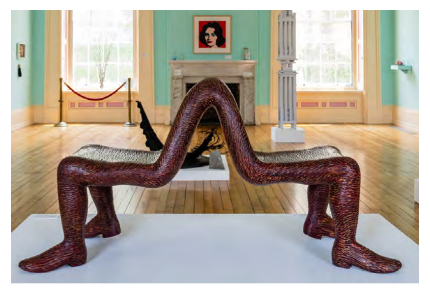
Wendell Castle, Handyman, Basswood, paint, 2004.